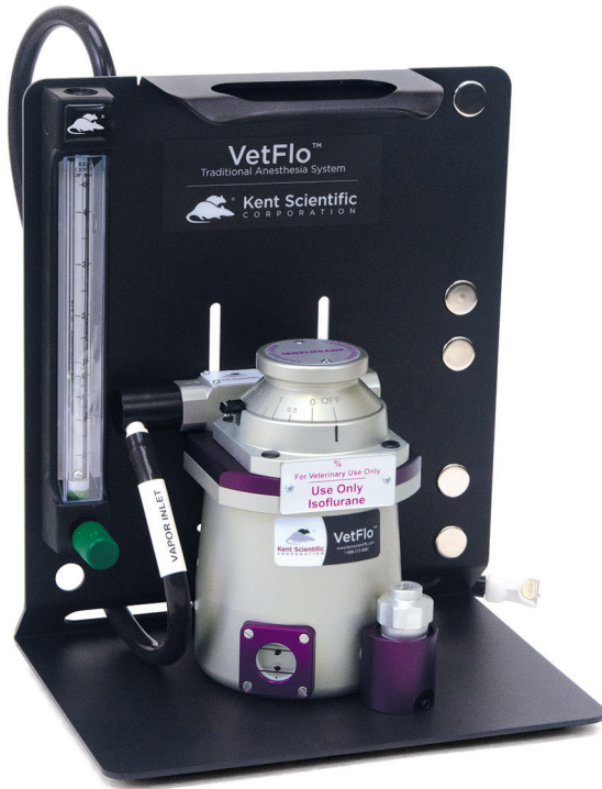
VetFlo vaporizer with single channel anesthesia stand