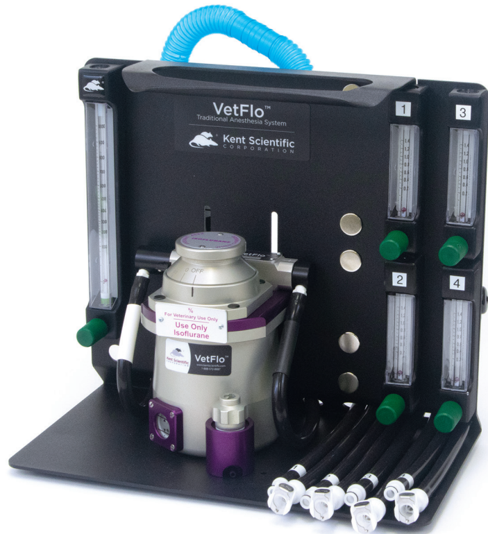
VetFlo vaporizer with four channel anesthesia stand