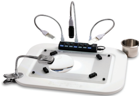
Surgical board with LED Lighting and Magnifier Kit SURGI-M01 / SURGI-R01