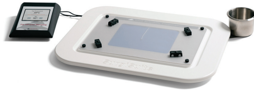
Surgical board with warming SURGI-M02 / SURGI-R02