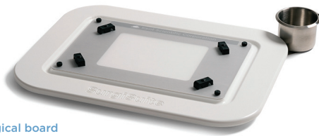
Surgical board SURGI-M / SURGI-R