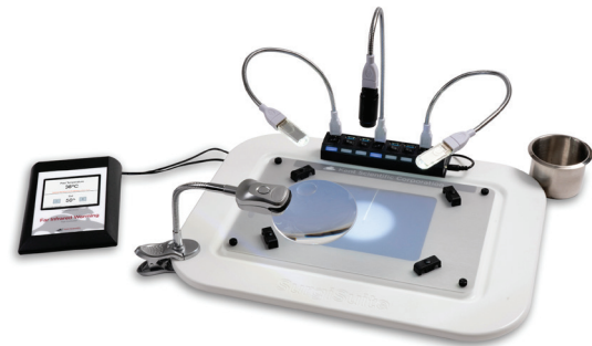
Surgical board with warming, LED Lighting and Magnifier Kit SURGI-M03 / SURGI-R03