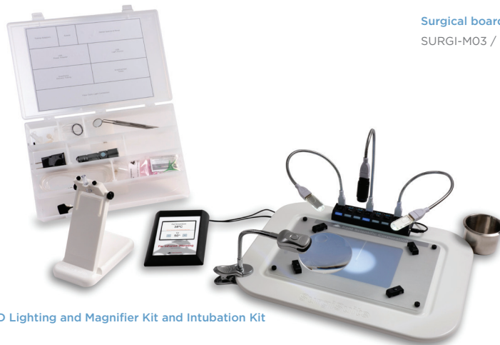
Surgical board with warming, LED Lighting and Magnifier Kit and Intubation Kit SURGI-M04 / SURGI-R04

Both the RightTemp® Jr. temperature monitor & homeothermic control and the PhysioSuite® with RightTemp and other optional physiological monitoring modules can easily connect to the SurgiSuite to provide regulated temperature control.