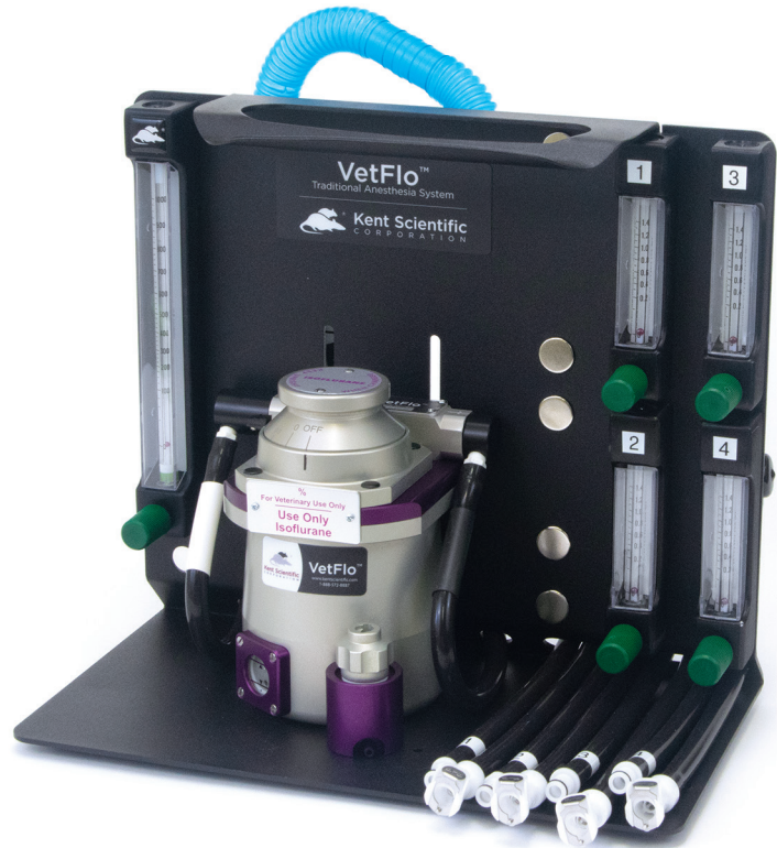
VetFlo vaporizer with four channel anesthesia stand