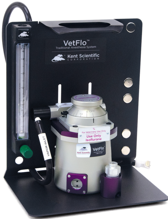
VetFlo vaporizer with single channel anesthesia stand