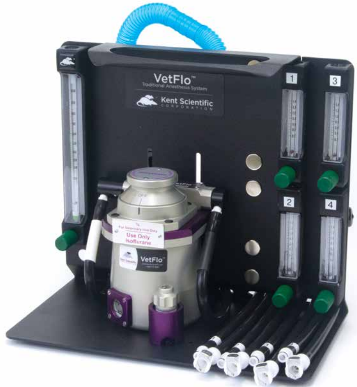
VetFlo vaporizer with four channel anesthesia stand