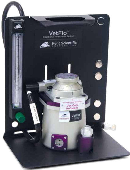
VetFlo vaporizer with single channel anesthesia stand