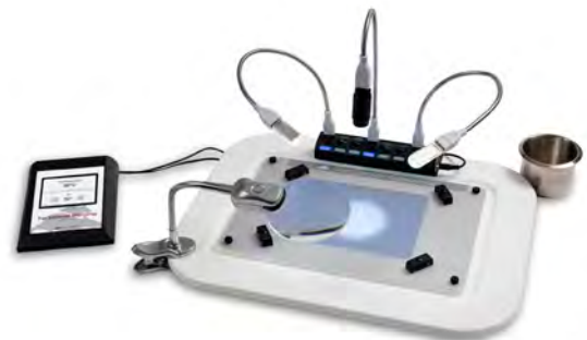
Surgical board with warming, LED Lighting and Magnifier Kit SURGI-M03 / SURGI-R03