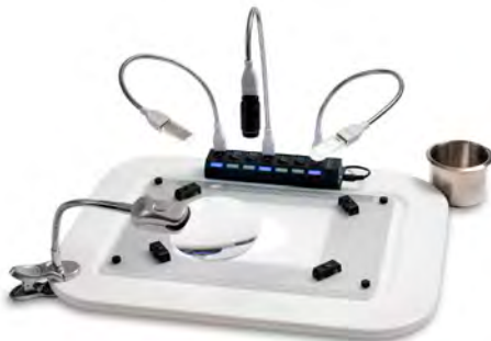
Surgical board with LED Lighting and Magnifier Kit SURGI-M01 / SURGI-R01