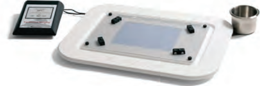
Surgical board with warming SURGI-M02 / SURGI-R02