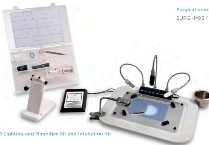
Surgical board with warming, LED Lighting and Magnifier Kit and Intubation Kit SURGI-M04 / SURGI-R04

Both the RightTemp® Jr. temperature monitor & homeothermic control and the PhysioSuite® with RightTemp and other optional physiological monitoring modules can easily connect to the SurgiSuite to provide regulated temperature control.