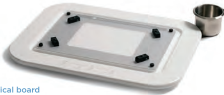
Surgical board SURGI-M / SURGI-R