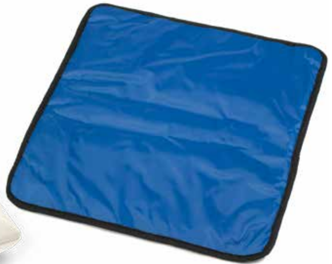
Includes 8" x 10" pad with two temperature probes