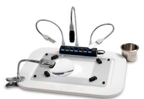
Surgical board with LED Lighting and Magnifier Kit SURGI-M01 / SURGI-R01