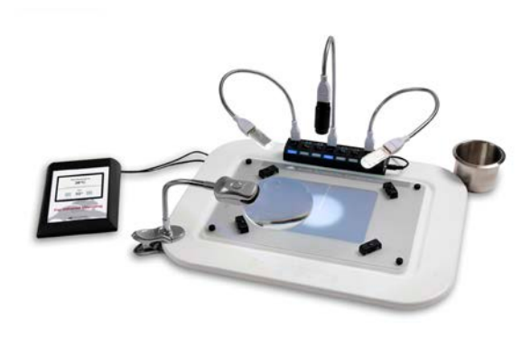
Surgical board with warming, LED Lighting and Magnifier Kit SURGI-M03 / SURGI-R03