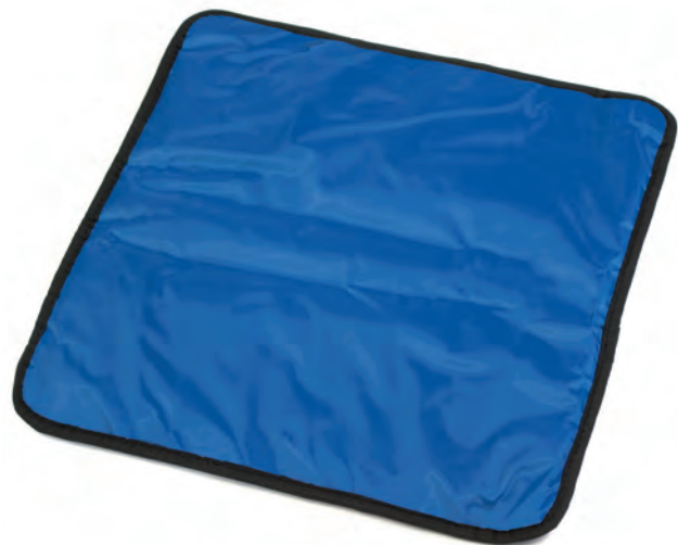
Includes 8" x 10" pad with two temperature probes