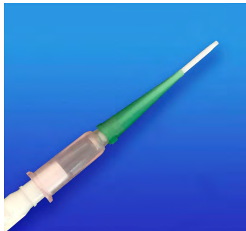
Intubation Tube with Safety Wedge