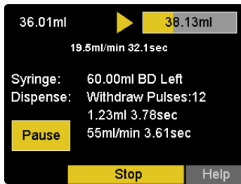
Infusion Volume Indicator