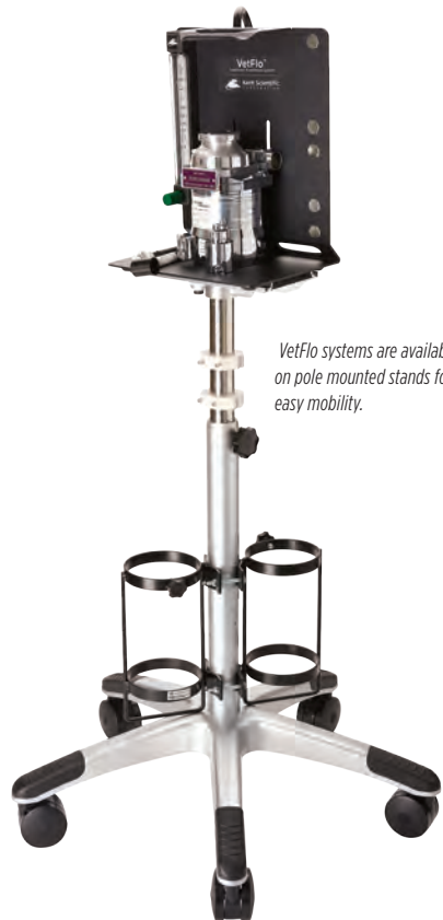
VetFlo systems are available on pole mounted stands for easy mobility.