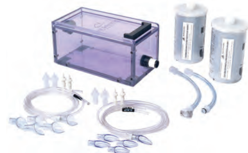
Starter Kit includes all the accessories needed to begin your procedure.

Multi-channel systems available for multiple animals